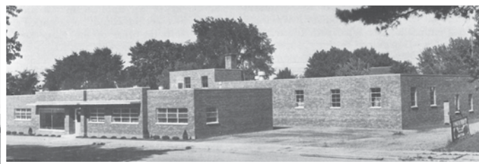
The advantages and efficiencies of the new headquarters building in Greenwood, completed and occupied in May 1949 and dedicated the following July 27-28, was a stepping stone to continuing progress for the cooperative and its total service operations. Since then, three additions have been made and a separate building has been added to the cooperative complex.

In accordance with that philosophy, REA systems were originally designed for an average consumption of 80 kWh per month, exactly double the monthly minimum bill established for 40 kWh per month. Many skeptics doubted that most of the farmers would ever be able to use up the 40 kWh per month minimum let alone double that amount. In examining proposed projects to determine whether there was a reasonable expectation that loans could be retired on schedule, REA originally used the basis of an anticipated average monthly consumption of 50 to 60 kWh per month. These were