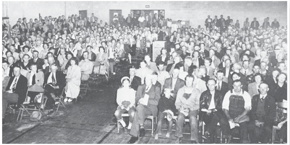
Pictured above is part of the crowd of 1,100 that attended the 1949 annual meeting of Clark Electric Cooperative in the Greenwood High School on June 14. A history book noted that annual meetings were always well attended, with Clark Electric's membership among "the most alert" of any cooperative in the state.

Millions of farmers throughout America were making this discovery for themselves, as were the members of Clark Electric Cooperative. They began using electricity for uses that few of them dreamed of when they first heard about the rural electrification program. As the age of electrified agriculture dawned, the unpredicted and still unpredictable increase in farmers' uses for electric power gave rise to another obstacle for electric cooperatives at this stage of their development: expanding power production and distribution facilities swiftly enough to keep pace