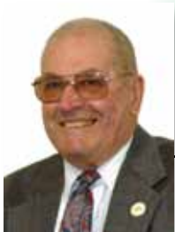
Howard Schultz (not eligible for re-election due to relocation)